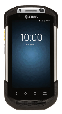
Zebra® TC75 Rugged Touch Computer