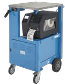
Powered Mobile Print Cart