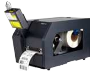
Online Data Validator (ODV)