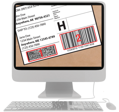
SwiftDecoder-S SDK for Non-Mobile Platforms