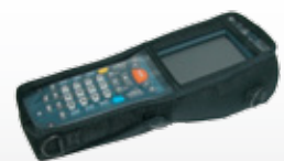
• Functional Case