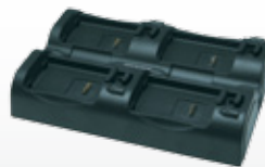
• Multiple Battery Charger