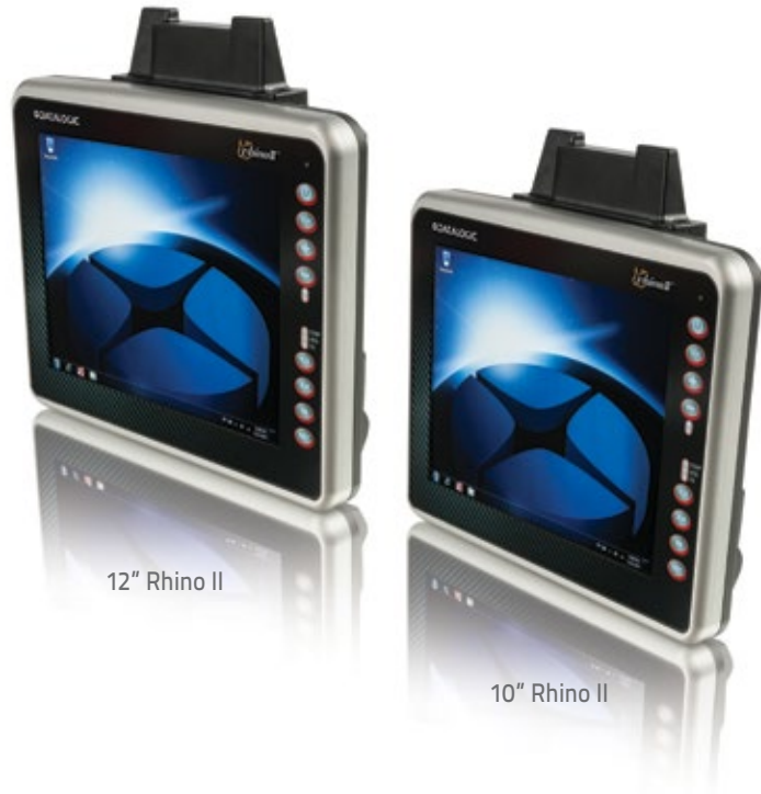
12" Rhino II

The Rhino II computer offers a choice of Windows Embedded Compact 7 (WEC7), Windows Embedded 7, or Windows 10 IoT Enterprise operating systems. Included are various Datalogic Utilities and on the WEC7 models, Wavelink® Avalanche™ and Terminal Emulation are pre-loaded and pre-licensed, allowing the Rhino computer to maximize return-on-investment (ROI) through easy deployment, device and maintenance management.