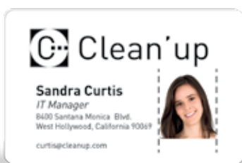
Maximum width of the color-printed area: 35 mm