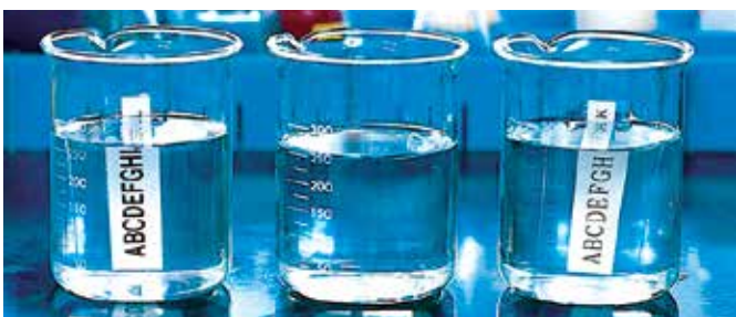
Water and chemical resistant

After laminated labels were placed in a fade-inducing chamber to simulate a year in sunny surroundings, the text was unaffected.