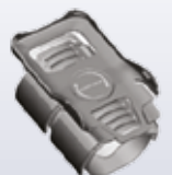
• Wearable Holder