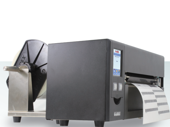
External Label Stand :10" Max. (Standard Package included)

GoDEX's HD830i is an eight-inch barcode printer designed for applications that require large and durable labels. The HD830i is a rugged printer of exquisite design which includes significant characteristics of high performance electronics, reliable mechanism, user -friendliness and easy maintenance design.