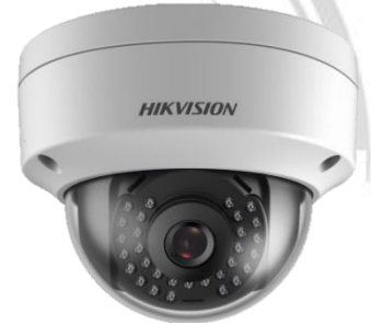
4 mm Fixed Lens