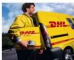
By express company

You can choose by DHL/TNT express, Air shipping, Sea.etc