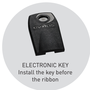
ELECTRONIC KEY Install the key before the ribbon

Up to 1 year after purchase, if stored in a cool, dry environment and having remained unopened from the original packaging. Storage temperature between 5-25°C (41-77° F) and at RH between 35-65%. Once opened, lifetime of 6 months, if stored under cool, dry conditions. Avoid dust and direct sunlight.