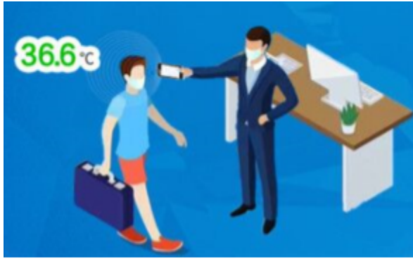
Scan on the staff temperature once they are entering premises.

Autotrack is our solid platform used by most of our existing customers in Malaysia and