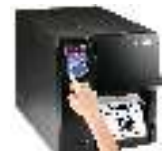
011Z6I014000 ZX1600I INDUSTRIAL PRINTER