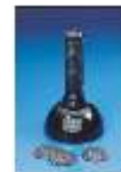
TR/AC GS2000UBP00 GS2000+GS2000U USB GUARD TOUR TERM

Factory owner always have to make sure their premises always secure even after the working period, any unforeseen event happen may cause big loses to the production floor next day. Losing none production material may not big losses to the organisation, the worse situation may happen if any losses happen on the important production material. After the company management invested on the security forces to patrol their premises during non working hours, they should also make a small investment on the device to make sure the security forces work according to their assigned task. Make sure the security make at least 3 route/night, give feedback to the factory management the death spot in the factory to minimize any losses.