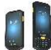
TC200J1KC111A6 TC20K PLUS MOBILE COMPUTER WITH LAN