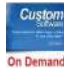
AUTOTRACK ON DEMAND FINISH GOODS WAREHOUSE INVENTORY CONTROL SYSTEM

Data capturing on your product shipping in bulk is one of the very challenging task especially you need to finish this task in the shortest possible time. What the common practice in the market is just scan in the item serial number and transfer it to the back end system.