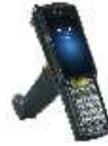
MC330MGI4HG2RW STANDARD GUN 802.11 ABGNAC BLUETOOTH 2D

Autotrack Asset tracking is design base on barcode as a core technology to track your entire company asset. Asset tracking make it simple to manage your businesses valuable assets, from software, IT assets, vehicles, tools, medical devices, and more. Instantly locate your assets, eliminate time spent searching for missing items and stop unnecessarily replacing lost assets.