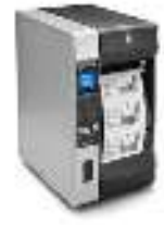
ZT61042T0E0100Z 4INCH INDUSTRIAL PRINTER