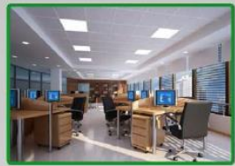
Time Attendance: Office