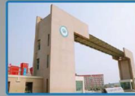
Networked Security: School