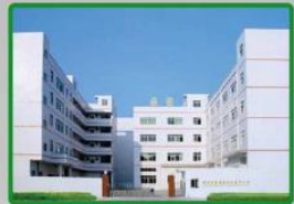
Time Attendance: Factory