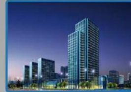
Networked Security: Building