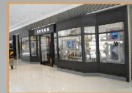
Standalone Access control: Shop