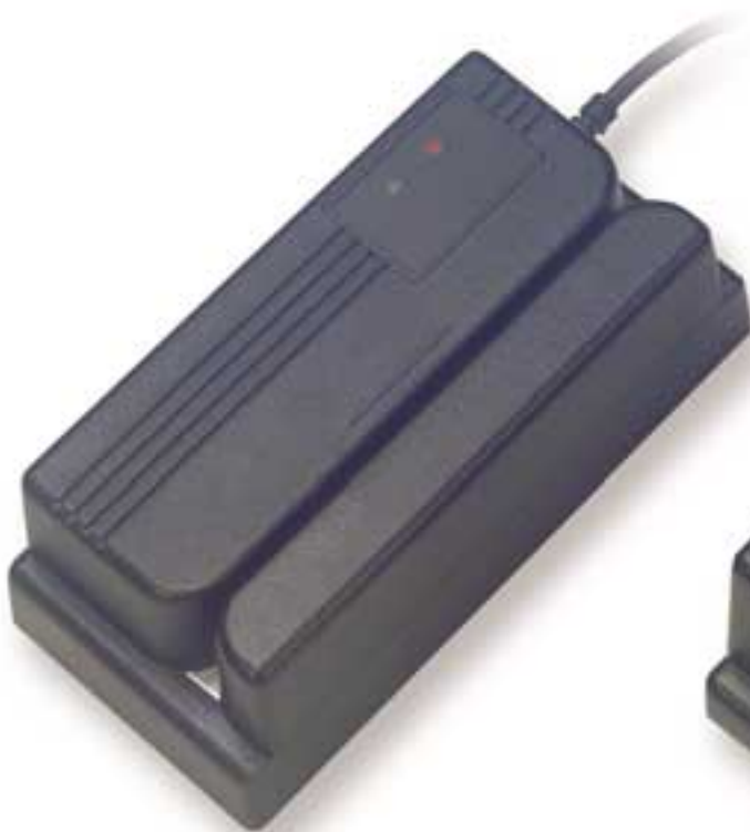
SLR-70 Series Plastic Housing