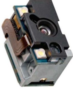
SE4750 1D/2D Standard Range Array Imager