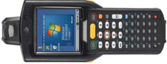
Microsoft Windows Embedded Compact 7.0