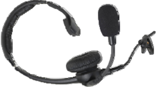
RCH51 Rugged Wired Headset

Rugged wired headset designed for use in nearly any environment