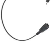
25-124389-01R Headset adapter cable

RCH51 headset adapter cable to standard 3-pole 2.5mm barrel jack. For MC32XX models.