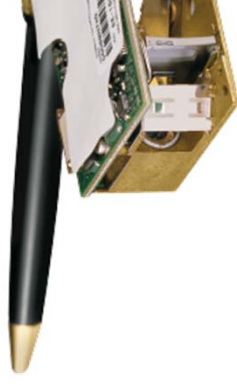
SE965 1D Standard Range Scan Engine