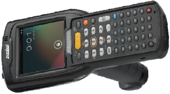
Android 4.1 Jelly Bean