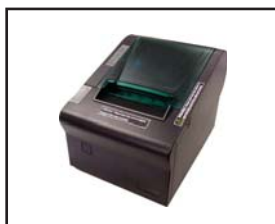
PRP-085III Receipt Printer