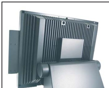
Industrial Grade Fanless Design