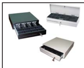
Durable Cash Drawers