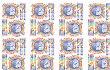
Evolis Genuine Globes Design