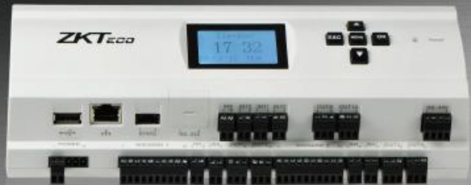
EC10 Elevator Control Panel