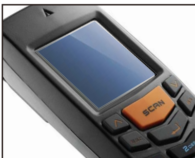
Vivid LCD Display with clear blue backlight