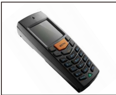
Light-Weight and ergonomic design